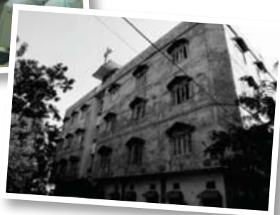
■ The main building