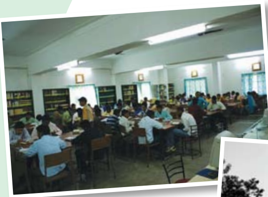
■ Their Library