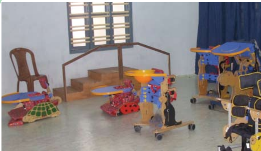
■ Deepti Centre for Children with Cerebral Palsy

We want to empower the children and their families to attain a physically, spiritually, socially, psychologically and economically productive life. Our challenges are enormous, needs are huge and goals are great. However, we believe God will help us reach that goal.