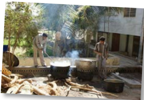
■ Rice for all those on the premises.

home in some villages includes believers. And this has resulted in all kinds of other transformations, socially and economically.