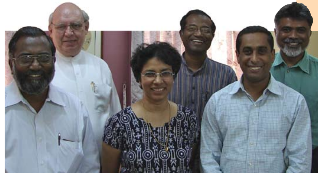
■ SABC team