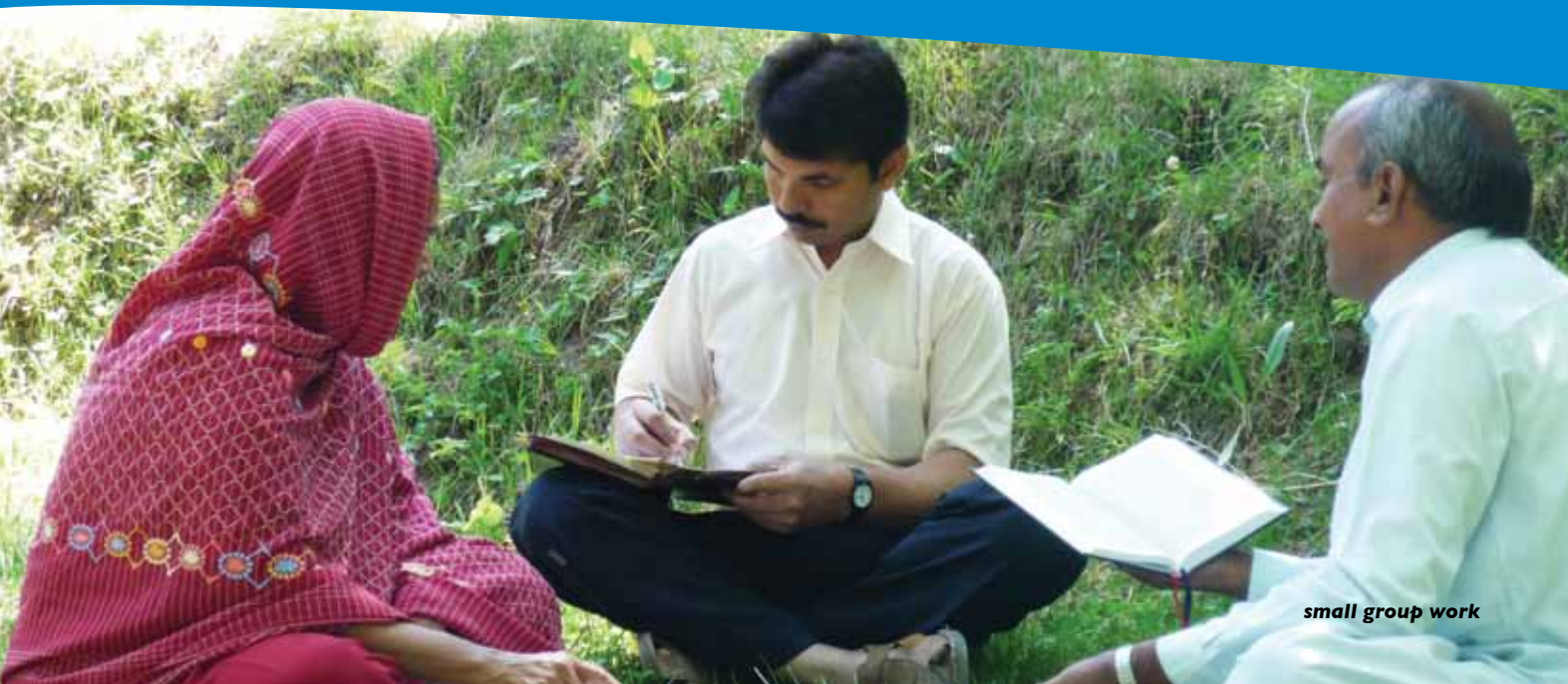
small group work