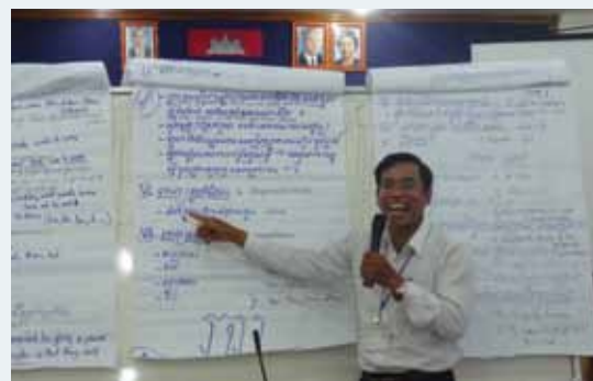
Does this structure make sense to anyone?

LP’s preaching ministry in Asia is primarily focused on the “3 BIG” countries (the one we try to avoid naming, India and Indonesia) and then “3 NEEDY” countries (Cambodia, Myanmar and Pakistan).