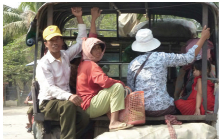
Local transport in Phnom Penh