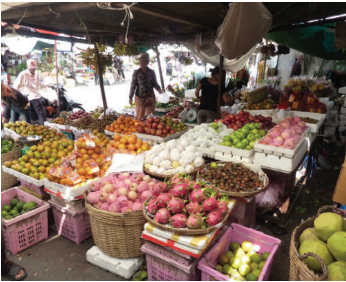
Local produce in Phnom Penh