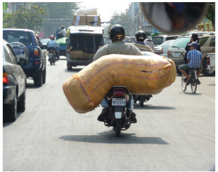
Local traffic in Phnom Penh

dark years. The number of believers in Cambodia has mushroomed from around 200 to approximately 250,000 in less than 20 years. Unfortunately this growing Church has not yet been adequately disciplined and believers have been thrust into leadership roles before truly understanding what it means to be a disciple of Christ. Fount of Wisdom sees its role in providing appropriate leadership and discipleship materials as a key component in the maturing and multiplication of the Church in Cambodia. Langham's Preaching program has already started the huge task of mentoring first generation preachers in Cambodia, so it is vital that preachers are equipped with the necessary literature resources. There is also a growing interest in personal development among the younger generation in Cambodia, Christian and non-Christian - a search for guidance in a rapidly changing world. FoW aims to publish selected books which address these needs, while communicating Biblical principles for living.