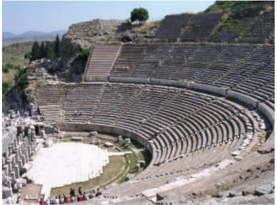
The Amphitheatre at Ephesus in Turkey

In his outstanding commentary on Ephesians, entitled GOD'S NEW SOCIETY , John Stott opens up the meaning, context and importance of what God had to say to the Ephesian church. Its publication in Turkish is in the pipeline. It brings a message of encouragement designed to strengthen the believers in their Christian faith, by explaining the nature and purpose of the church, the body of Christ. Paul planted the church in Ephesus in AD53, and served there for 3 years. But Christian living and growing today is not easy or straightforward. Although a nominally secular state, almost everyone is Muslim. Converts, if they go public, face all sorts of challenges,